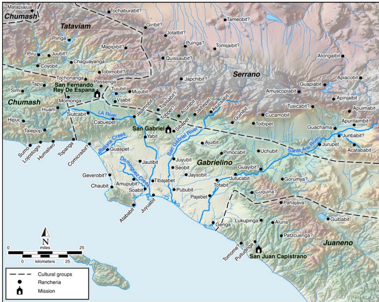
Figure 2. Approximate locations of Native American rancherias documented in mission records (rancheria locations and ethnic boundaries adapted from King 2004:Figure 2).

listed, which confirmed that child’s origin in Guaspet. Connections between parents and other rancherias among what King calls the western Gabrielino place the rancheria in the general locality of the Ballona. Of note are names of spouses from the nearby rancherias of Comicraibit and Jautibit, located by King (2004:Figure 2) between the pueblo and Santa Monica Bay (see Figure 2). Somewhat later in time, marriage partners came from slightly more distant settlements, such as Pimubit, identified as Catalina Island, and Soabit, located near San Pedro.