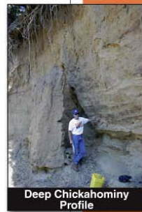
Deep Chickahominy Profile