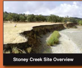
Stoney Creek Site Overview