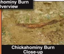
Chickahominy Burn Close-up