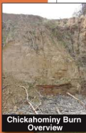
Chickahominy Burn Overview