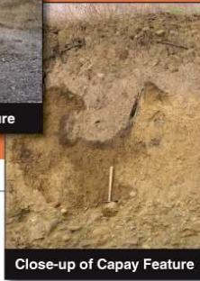
Close-up of Capay Feature