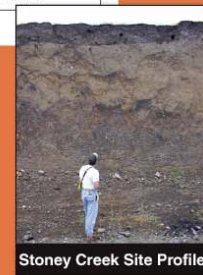
Stoney Creek Site Profile