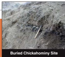
Buried Chickahominy Site