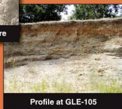
Profile at GLE-105