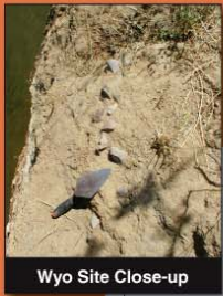
Wyo Site Close-up