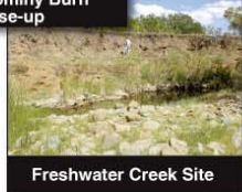
Freshwater Creek Site