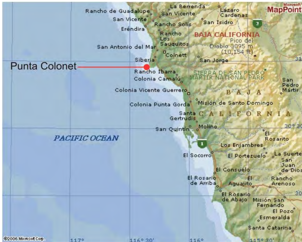
Figure 1. Punta Colonet in northwest Baja California.