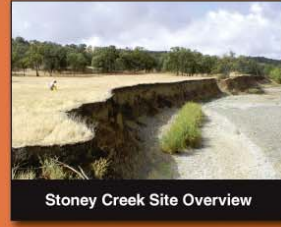
Stoney Creek Site Overview