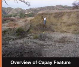
Overview of Capay Feature