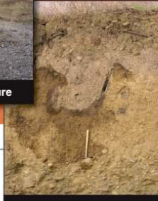
Close-up of Capay Feature