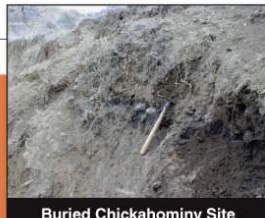
Buried Chickahominy Site