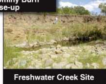
Freshwater Creek Site