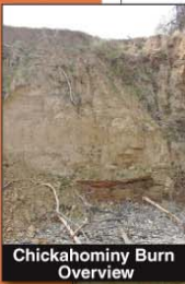
Chickahominy Burn Overview