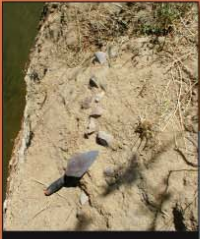
Wyo Site Close-up