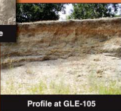
Profile at GLE-105