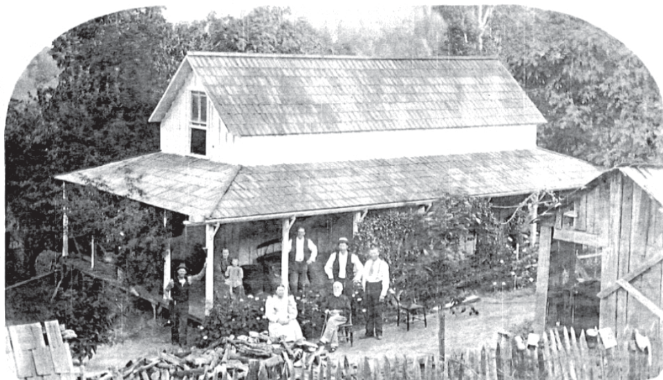
Figure 5: The main house on the Fischer homestead, with Theodore and Doretta and family, ca. 1890.

Once features were identified and cleared, the remains of the house were found to be clearly marked by low basalt slabs. A well-used dump, buried by sediments and vegetation, was found by metal detection to the east of the house along a creek, a short walk from the back door. To the west, the barn was linked to the house with a cobble-lined path. Two improved springs were located near the residence—one cut into the subsoil and another with a cobble cistern. Artifacts were plentiful, with all appearing to date to the Nashes' fairly short tenure. While this site lacks the exceptional documentation of the Smith and Fischer sites, the clarity of the features and of the layout of the farm are ample testament to the site's history. The site lies at the edge of public land, with little to draw visitors. Except for State fence-building and maintenance activities, the site appears untouched by the events of the past century.