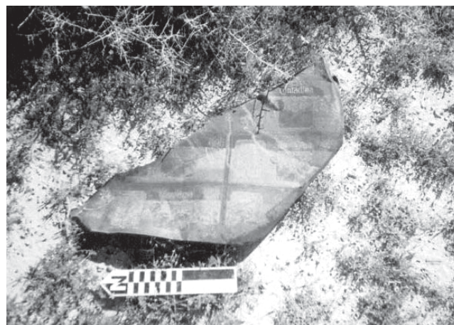
Figure 2: Example of pre-cut cans on sheet metal.

Cans exhibiting bulging or dents may indicate poorly canned products, spoilage, or leaks; therefore, certain medicinal products such as bitters, Phillips Milk of Magnesia, etc., found in association with these cans may indicate health problems, such as botulism.