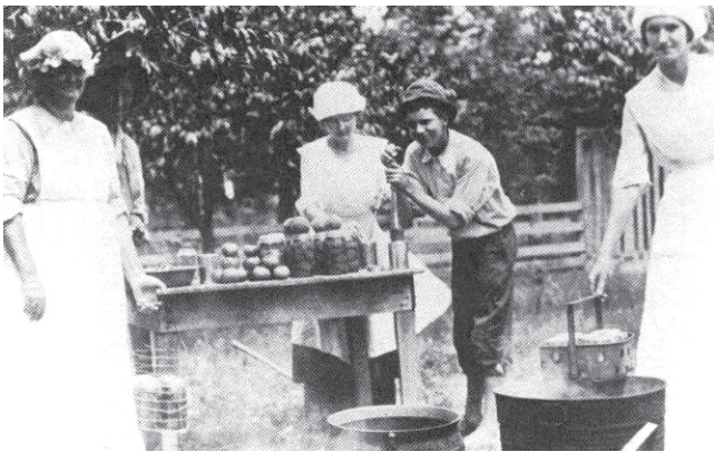
Figure 5: Women canning (Malcolm 1917).

It should also be noted that an article in the January, 1875 American Agriculturalist offered additional suggestions for the uses of cans, such as making a dipper, pitcher, or measure; covering mouse and rat holes; or for using an improvised saucepan, fruit pickers, grater, cake ring, or lantern (Franklin 1997: 582). As Swope and Vrendenburg (2003) have noted, both glass jars and cans (especially pocket tobacco tins) have often been used for storage of mining-claim papers. Lids could be used to patch holes in walls or floors; recent field observations noted the use of can lids to mark the edges of dirt roads (Spinney and Puckett 2006).