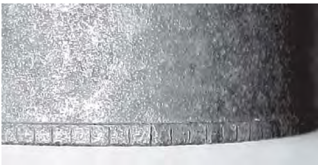
Figure 4: Example of marks along edges of can rim.