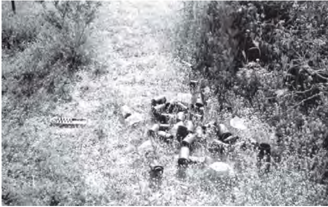
Figure 3: Overview of trash dump containing cans and glass.