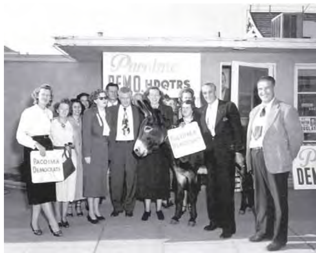
Figure 3: Helen Gahagan Douglas pictured behind donkey's head with a group of Pacoima Democrats in her 1950 Senatorial campaign against Richard Nixon.