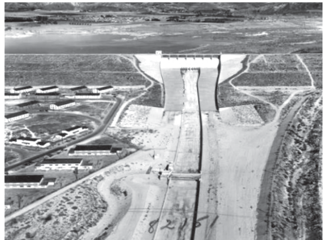
Figure 2 (Bottom): Aerial photograph dated September 1940, the barracks are not extant.