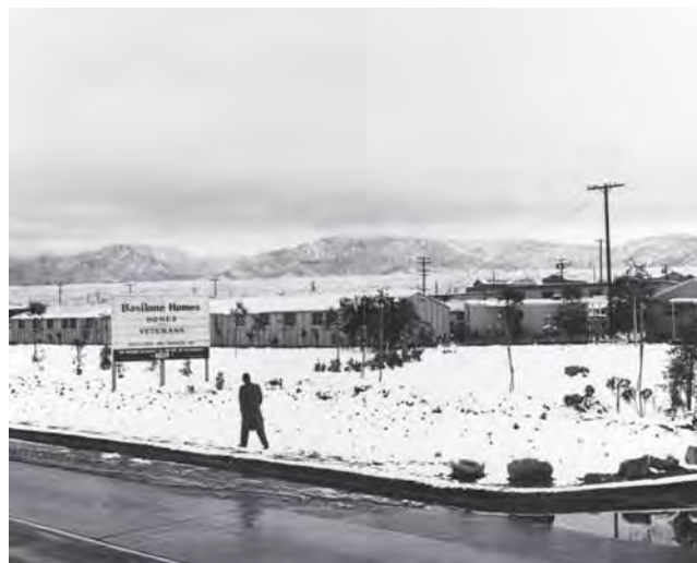
Figure 4: A closeup of the Basilone Homes community at Hansen Dam, January 1947, dam in background.