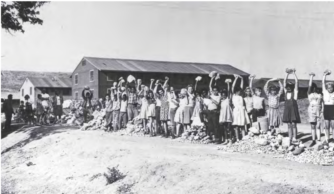
Figure 10: Basilone Homes children participating in a May, 1948 Valley cleanup, dam in background.