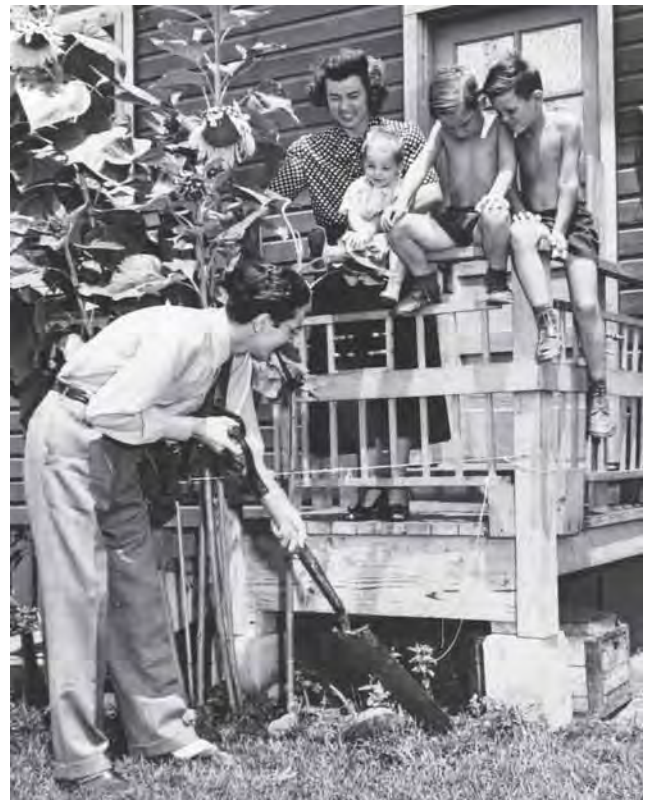
Figure 9: A Basilone Homes resident plants a garden.