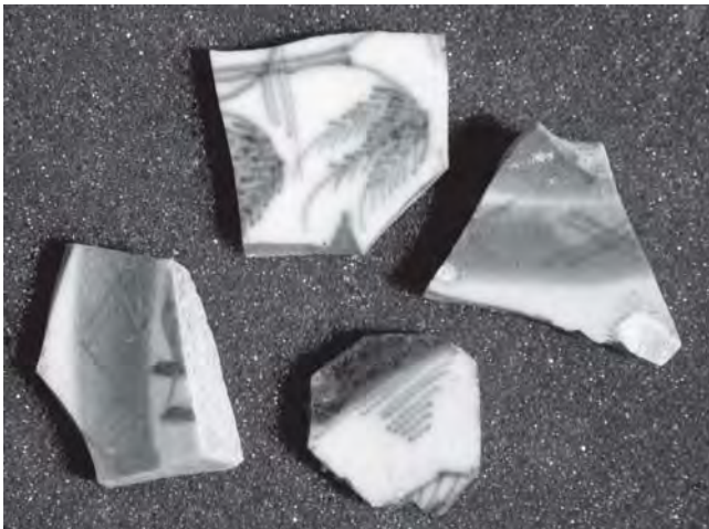
Figure 5: Chinese Porcelain.