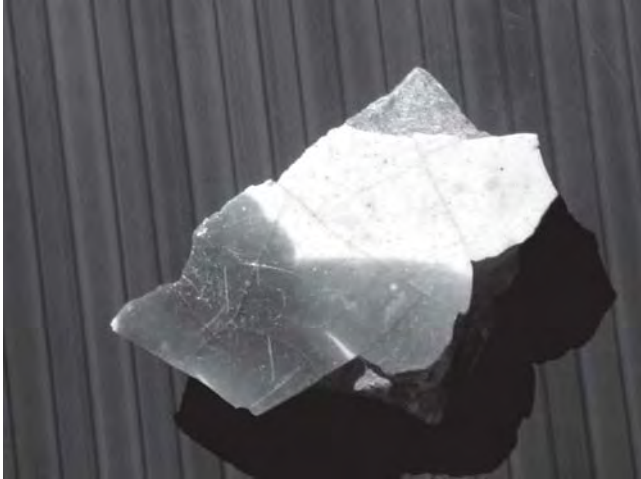
Figure 1: Wavy Rim Majolica.