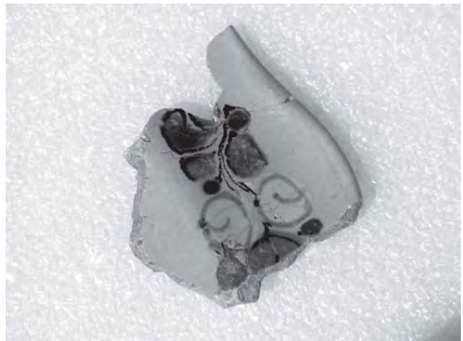
Figure 6: Tumacacori Majolica.