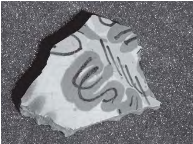
Figure 3: Monterey Majolica.