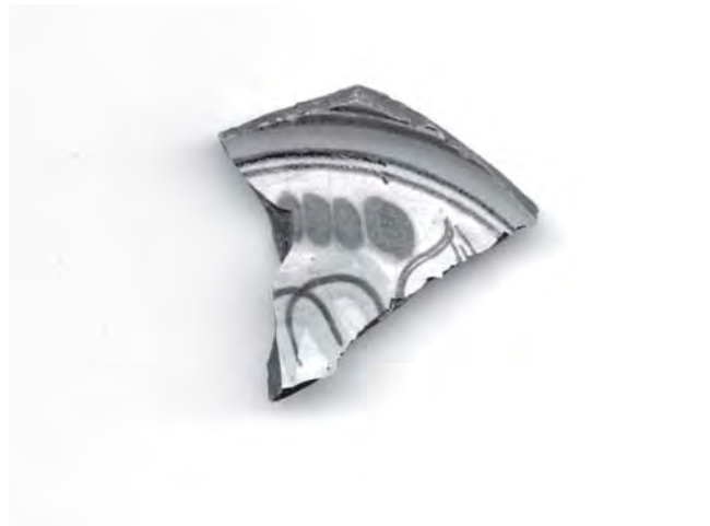
Figure 4: Monterey Majolica.